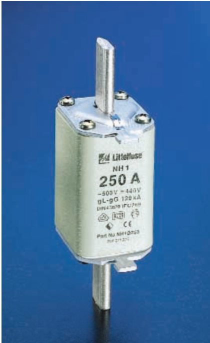
All NH fuse links incorporate a blown fuse indicator.

Littelfuse European style NH fuse links are designed for the protection of conductors and motors. The gL-gG characteristic fuse links are generally used to protect cables and installation lines from overload and short circuits. The aM characteristic fuse links are used for the short circuit protection of motors and switchgear. They are available in NH00C to NH3 sizes up to 630 amperes.