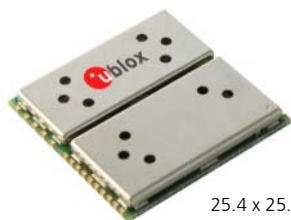
25.4 x 25.4 x 3 mm

The TIM-LR is an ultra-low power sensor-based dead reckoning GPS module suitable for passive and active antennas. The combination of the ANTARIS GPS positioning engine and the Enhanced Kalman Filter EKFTM algorithm provide precise navigation in locations with no or impaired GPS reception, for example tunnels, indoor car parks and deep urban canyons. Deviations in navigation caused by multipath effects, as commonly observed in cities with densely populated high-rise buildings, belong to the past. The TIM-LR is the ideal solution for high-volume applications requiring a cost-effective and tightly integrated product that fulfills 100% road coverage requirement.