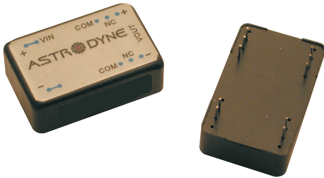
Unit measures 0.8"W x 1.25"L x 0.5"H