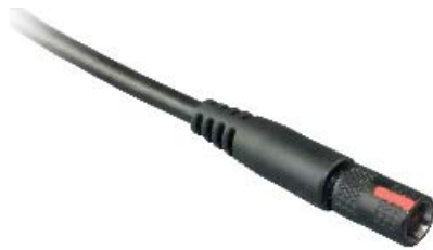
Series 804 Overmolded ASAP Cordset

Glenair's ASAP "Mighty Mouse" Overmolded Cordsets offer watertight sealing and excellent cold temperature flexibility. These cables are 100% tested and ready to use. Standard overmolded cables feature polyurethane jackets.