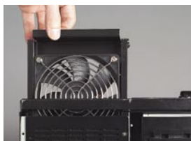
Easy-to-maintain cooling fan & filter