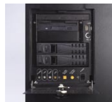
One slim CD-ROM drive, two 3.5" disk drives & two removable SATA HDD trays