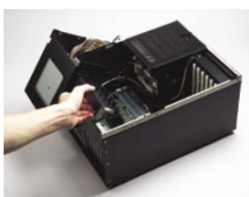
Power supply bracket with hinges