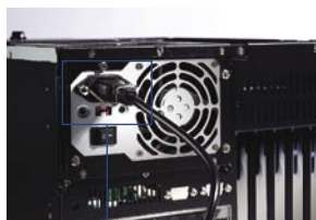
Plug ring-lock securely fastens the power cord (PS-400ATX-ZB)