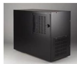
Bidirectional wall-mountable design