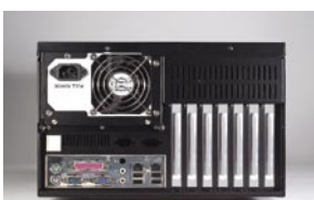
Bottom view of IPC-7143