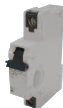
Add-on Neutral Pole