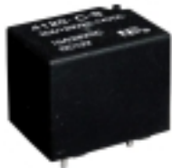
Dust Covered 26.8×21.5×22.3