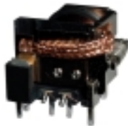
Open Type 24×19×20