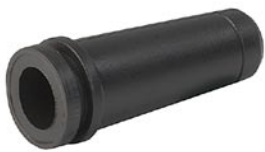
HN 14.109 PVC Strain Relief