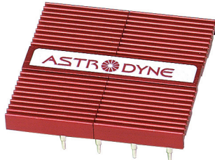
Unit measures 1.5"W x 2"L x 0.4"H