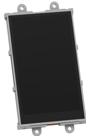
The uLCD-32W-PTU Display Module