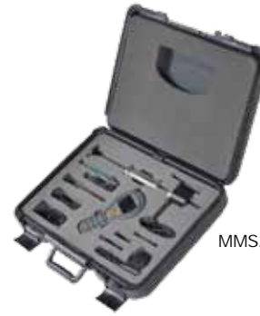
MMS2 Hard Carry Case Kit

Accuracy at 77°F (25°C) +/- 1.3°F (0.7°C)