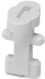
Locking element for locking the PCB onto UM-BASIC/PRO housing at level 3

Please be informed that the data shown in this PDF Document is generated from our Online Catalog. Please find the complete data in the user's documentation. Our General Terms of Use for Downloads are valid ( http://phoenixcontact.com/download )